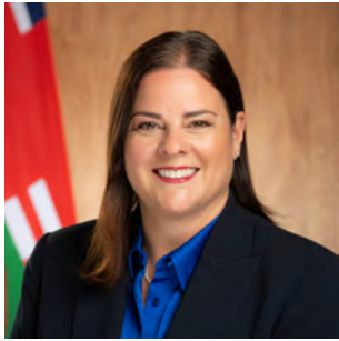
Honourable Heather Stefanson Premier of Manitoba