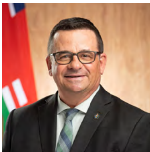
Honourable Jeff Wharton Minister of Environment, Climate and Parks