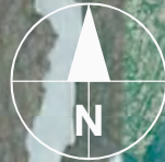
Location of Project Components and Existing HBMS Facilities

SCALE: 1:50,000 PROJECTION: UTM ZONE 14 NAD83 IMAGE SOURCE: GOOGLE EARTH PRO 2012