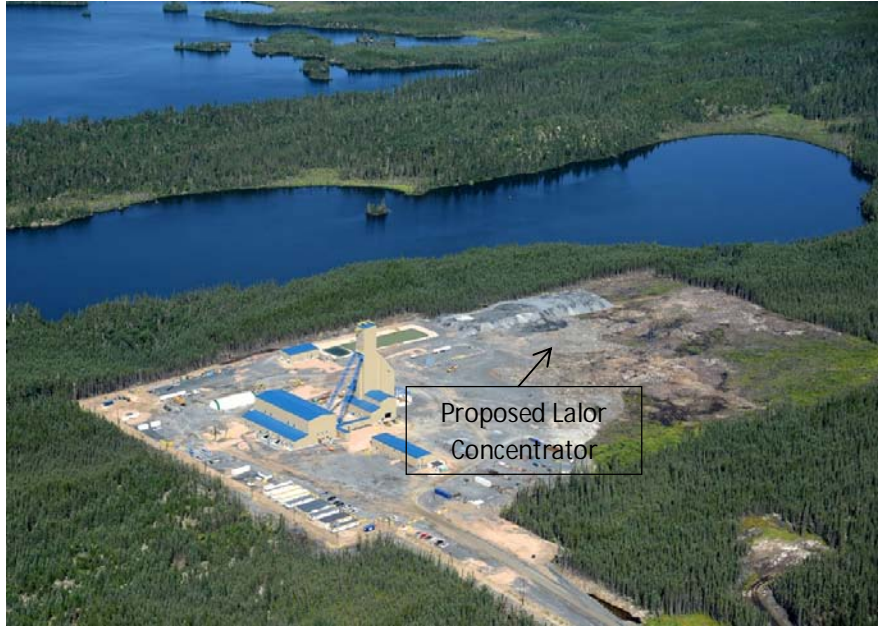
Photo 1 - Aerial view of the Lalor site, looking northwest and showing the location of the proposed Lalor Concentrator.