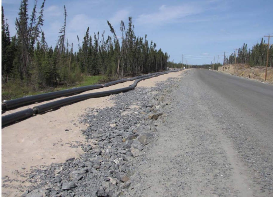
Photo 3 - Corridor of the Pipeline System (along the Lalor Access Road from Lalor site to PR 395).