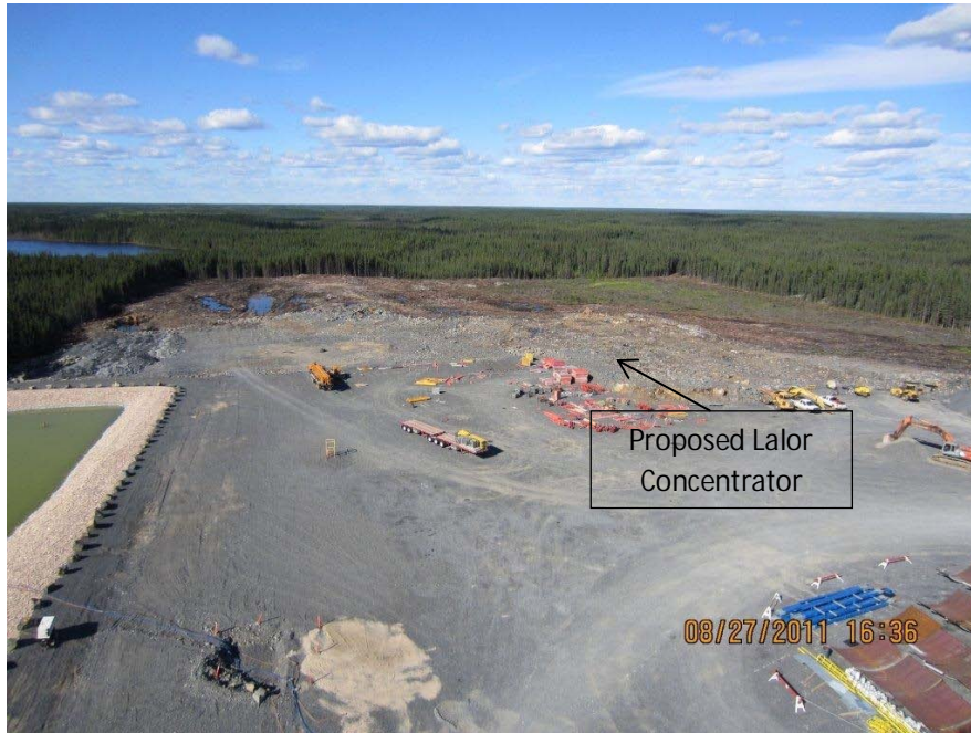
Photo 2 - Location of the proposed Lalor Concentrator, looking north.