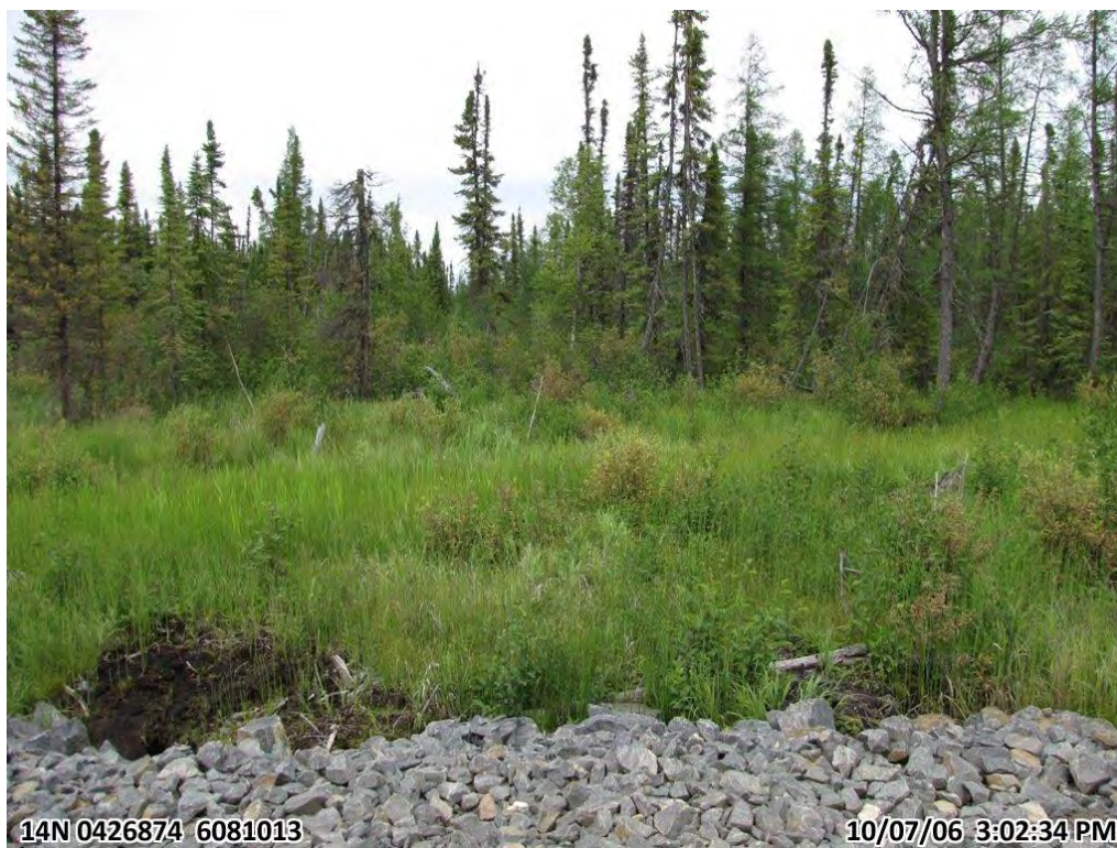
Photograph 55. Vegetation along disturbed area of Lalor access road (6 July 2010)