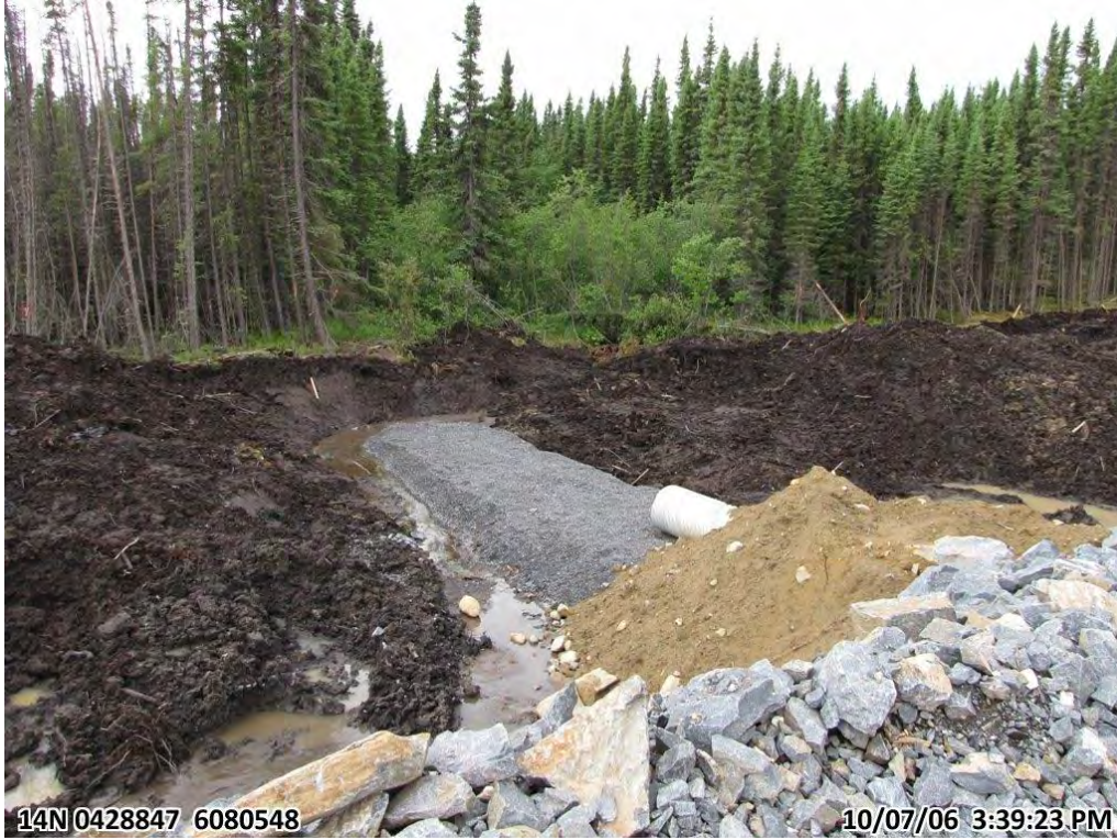
Photograph 61. Culvert crossing 1 (Lalor access road) (6 July 2010)