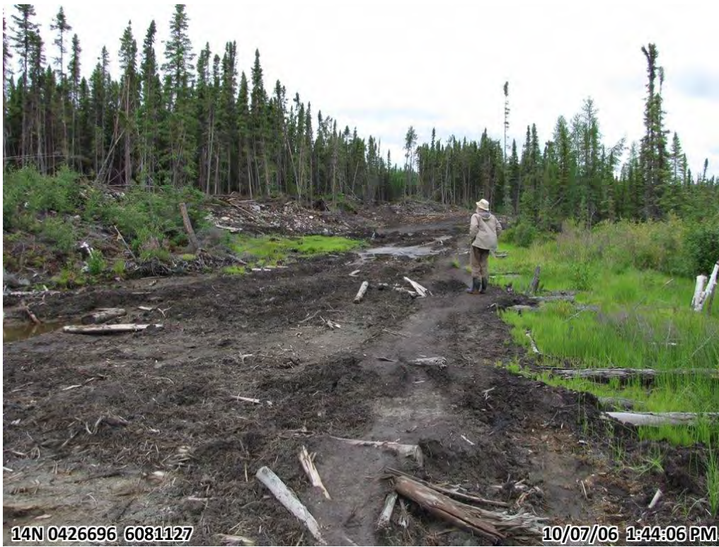
Photograph 33. Wetland at end of existing drill road (6 July 2010)