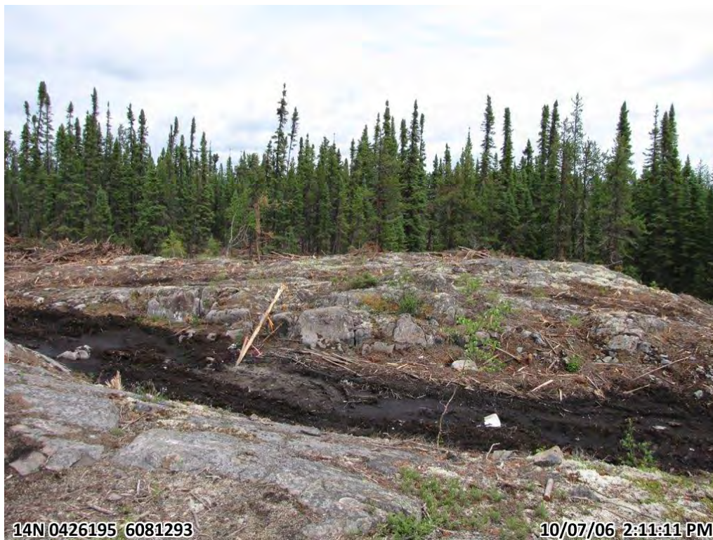
Photograph 40. Panoramic of cleared Lalor site, numerous bedrock ridges (6 July 2010)