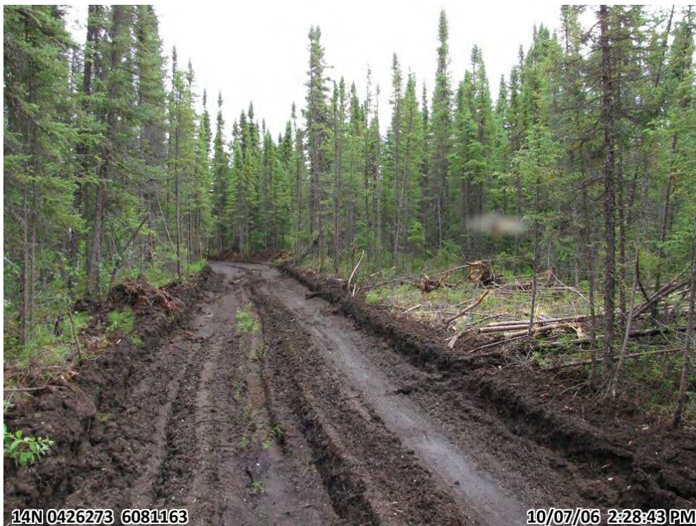
Photograph 51. Drill road off south side of site (6 July 2010)