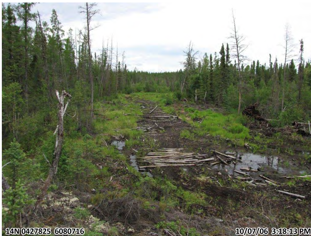
Photograph 56. Drill road to north of cleared alignment (6 July 2010)