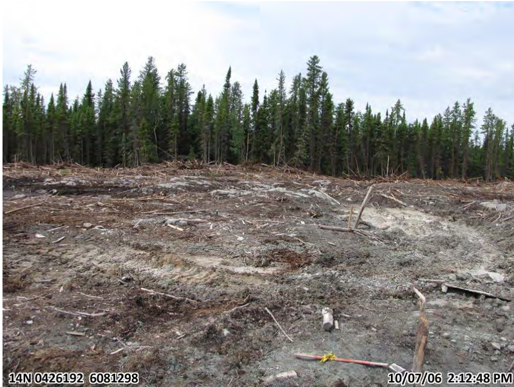
Photograph 47. Panoramic of cleared Lalor site, numerous bedrock ridges (6 July 2010)