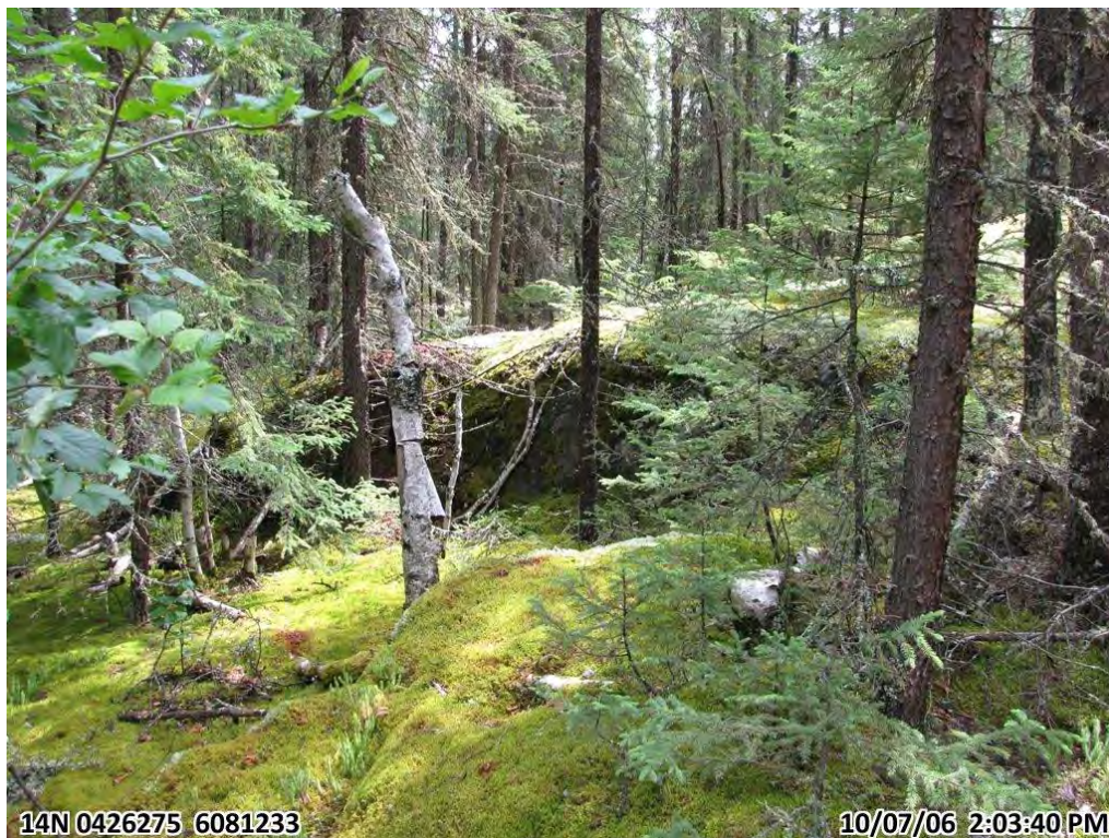
Photograph 36. Deep sphagnum to east of Lalor site, black spruce canopy (6 July 2010)