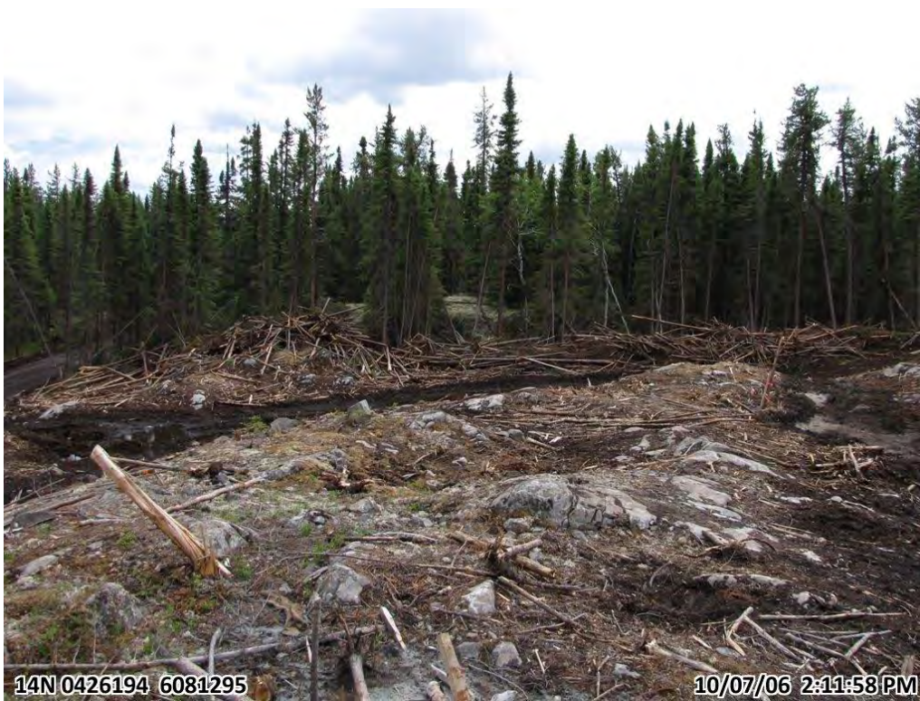
Photograph 43. Panoramic of cleared Lalor site, numerous bedrock ridges (6 July 2010)