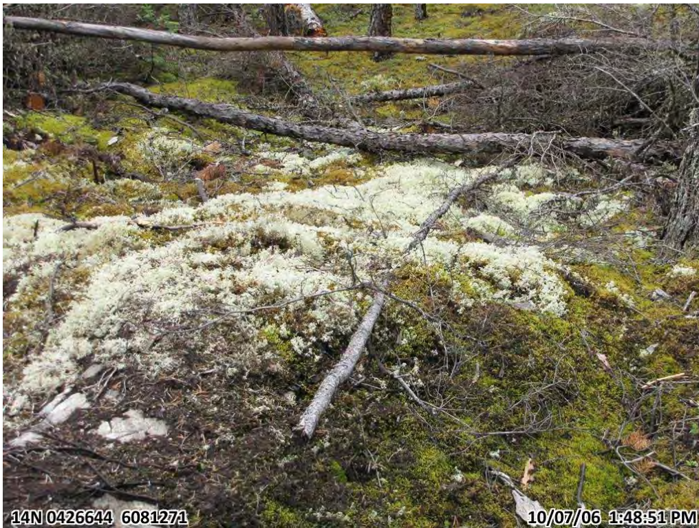
Photograph 34. Lichen and sphagnum to east of Lalor site (6 July 2010)