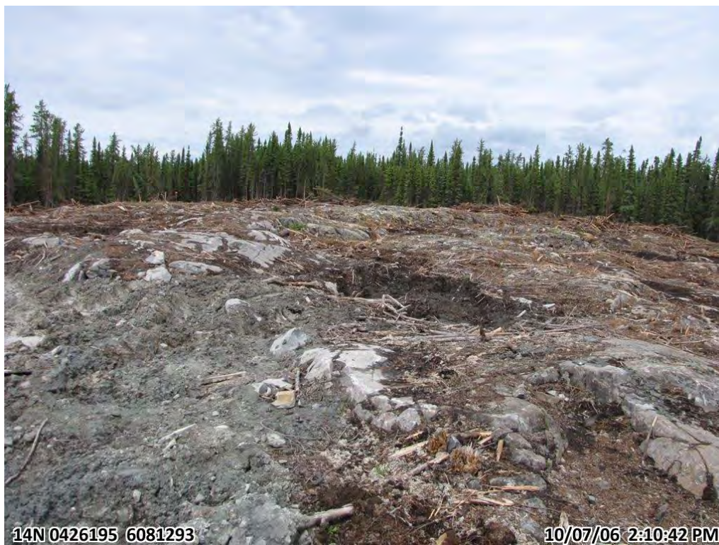
Photograph 38. Panoramic of cleared Lalor site, numerous bedrock ridges (6 July 2010)