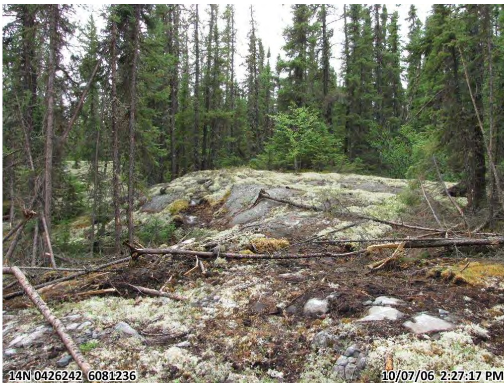
Photograph 50. Bedrock and lichen south of site (6 July 2010)