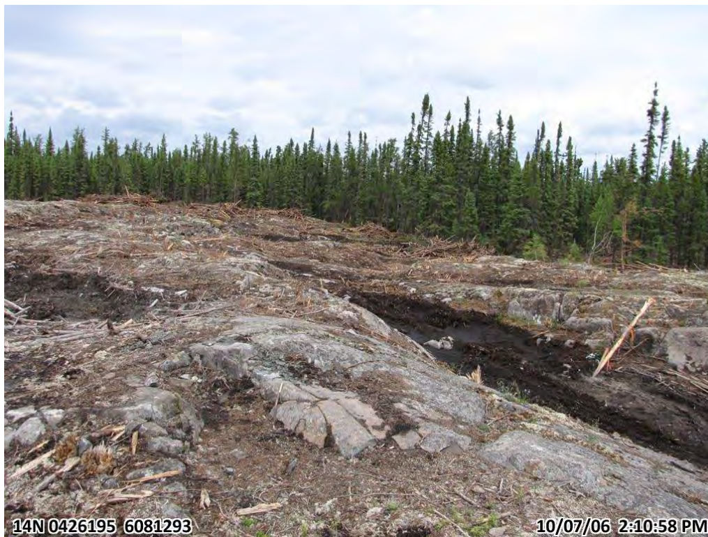
Photograph 39. Panoramic of cleared Lalor site, numerous bedrock ridges (6 July 2010)