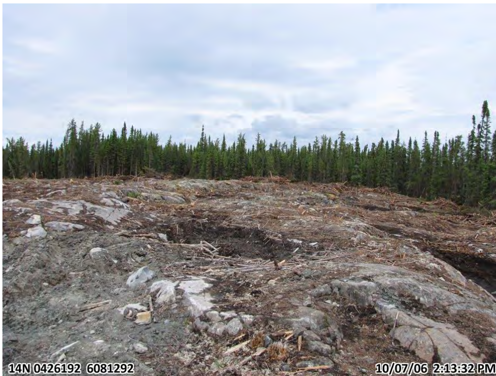
Photograph 49. Panoramic of cleared Lalor site, numerous bedrock ridges (6 July 2010)