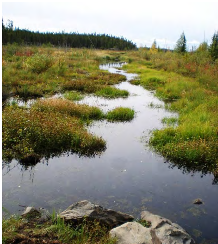
Photograph 31. Ghost Lake outflow at old rail bed, looking south (6 Sept 2007)