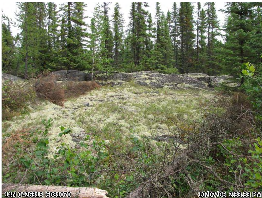
Photograph 52. Open canopy and treed rock to south side of Lalor site (6 July 2010)