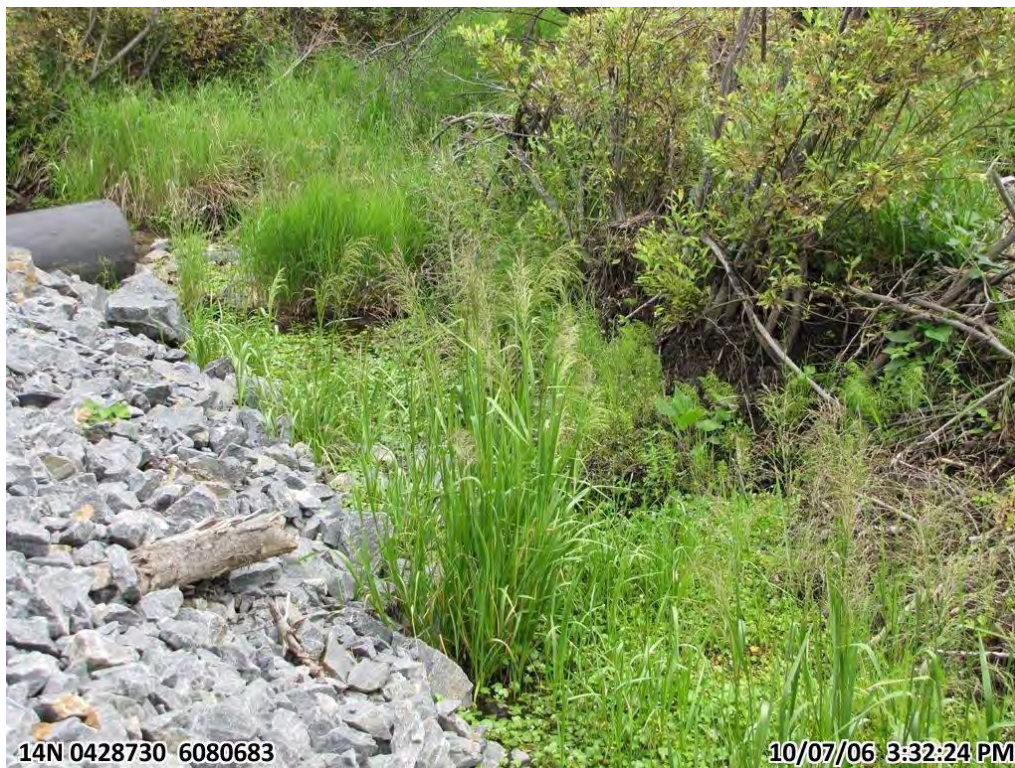
Photograph 59. Vegetation upstream of culvert crossing 1 (former drill road) (6 July 2010)