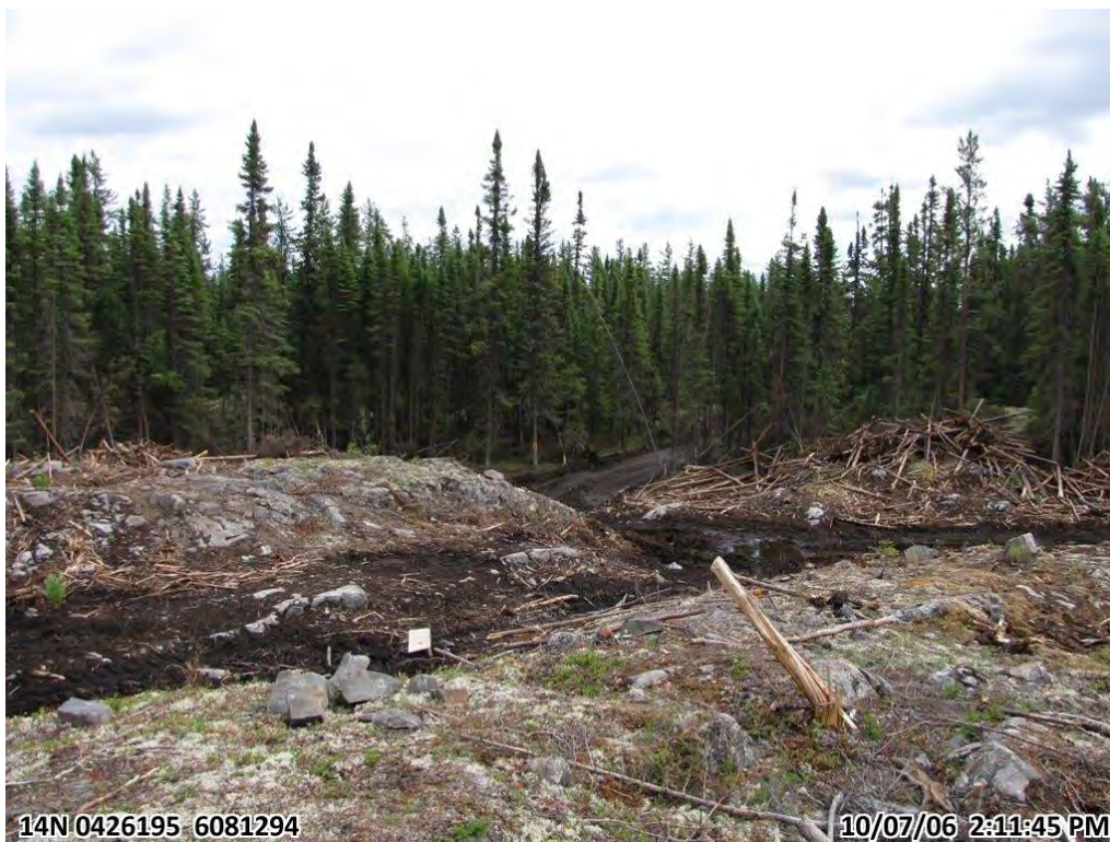
Photograph 42. Panoramic of cleared Lalor site, numerous bedrock ridges (6 July 2010)