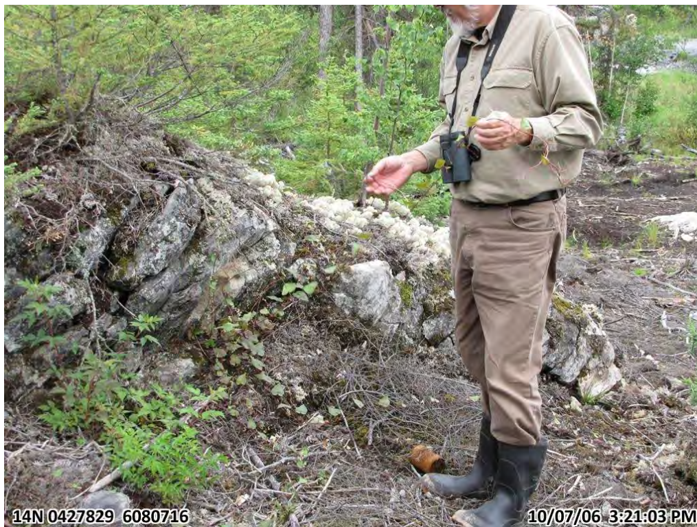
Photograph 57. Disturbed area to north of Lalor access road alignment (6 July 2010)