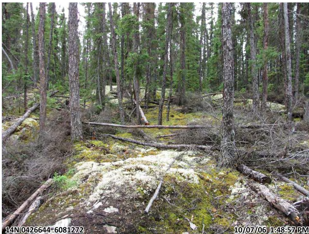
Photograph 35. Lichen and sphagnum to east of Lalor site (6 July 2010)