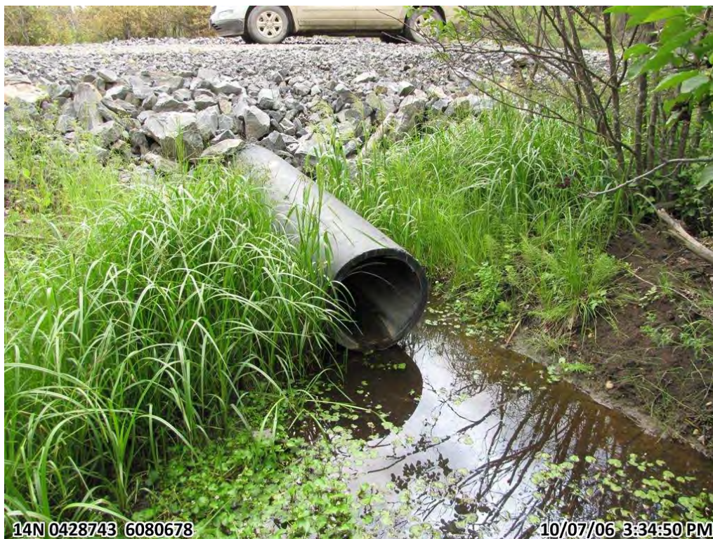
Photograph 60. Vegetation downstream of culvert crossing 1 (former drill road) (6 July 2010)