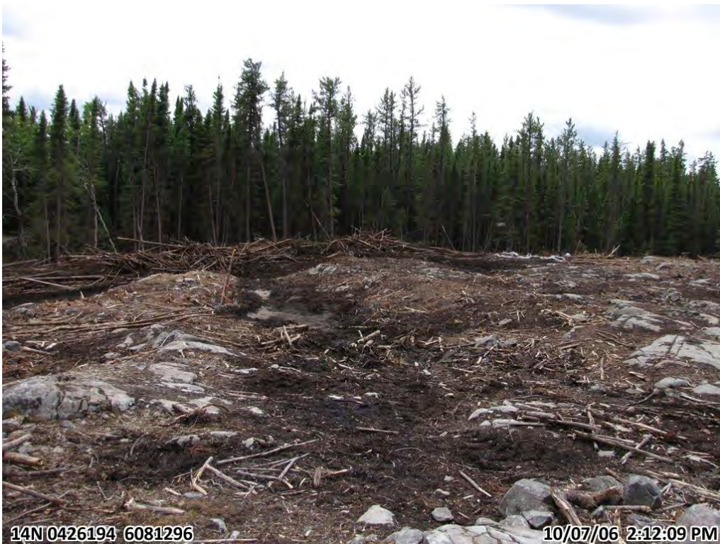
Photograph 44. Panoramic of cleared Lalor site, numerous bedrock ridges (6 July 2010)