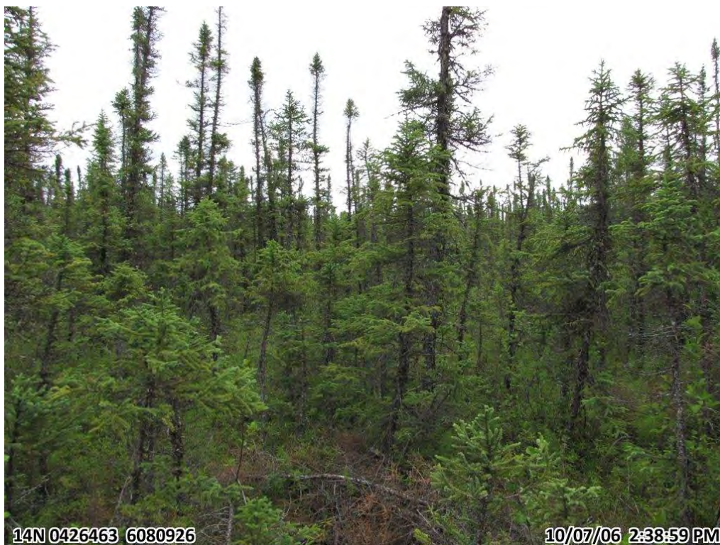
Photograph 53. Treed muskeg to south side of Lalor site (6 July 2010)