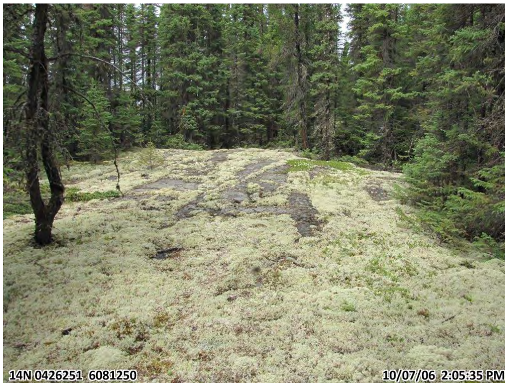
Photograph 37. Lichen cover on bedrock outcrop (6 July 2010)