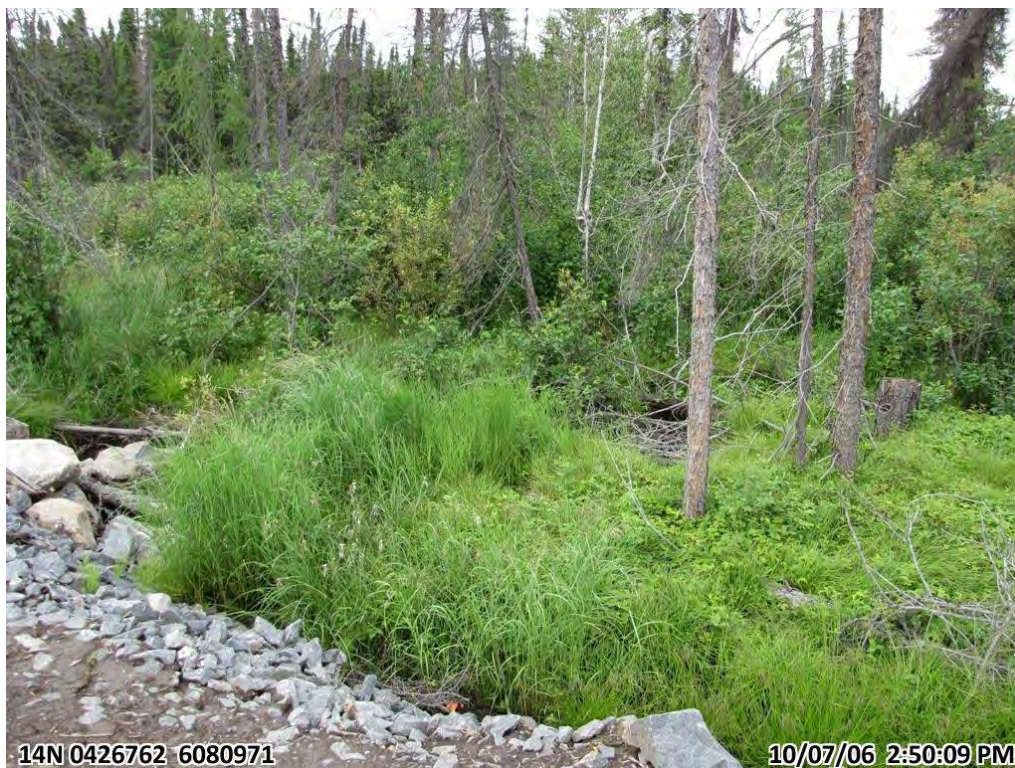
Photograph 54. Grasses at cleared drill site at end of existing drill road (6 July 2010)