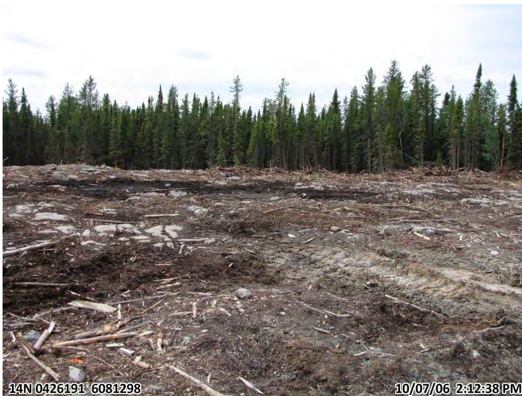
Photograph 46. Panoramic of cleared Lalor site, numerous bedrock ridges (6 July 2010)