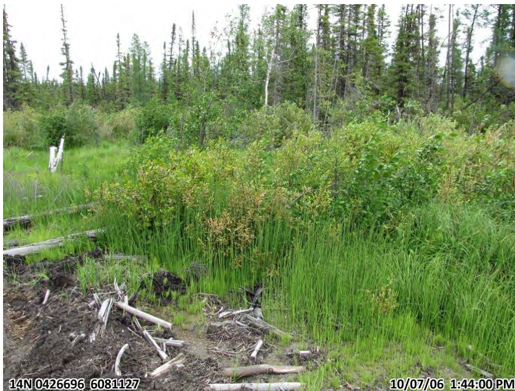
Photograph 32. Wetland at end of existing drill road (6 July 2010)