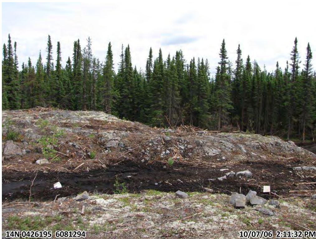
Photograph 41. Panoramic of cleared Lalor site, numerous bedrock ridges (6 July 2010)