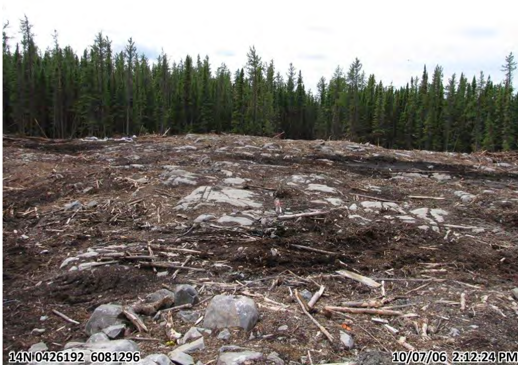
Photograph 45. Panoramic of cleared Lalor site, numerous bedrock ridges (6 July 2010)