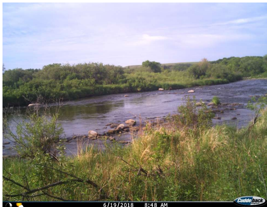
Photo 2: Early season, moderate water flow (5.660 m 3 /s upstream of diversion; comparable to Photo 1 May 30, 2018), pumping withdrawal for irrigation (0.5060 m 3 /s removal) for estimated flow rate downstream of diversion of 5.153 m 3 /s ) during pumping for irrigation (June 19, 2018)