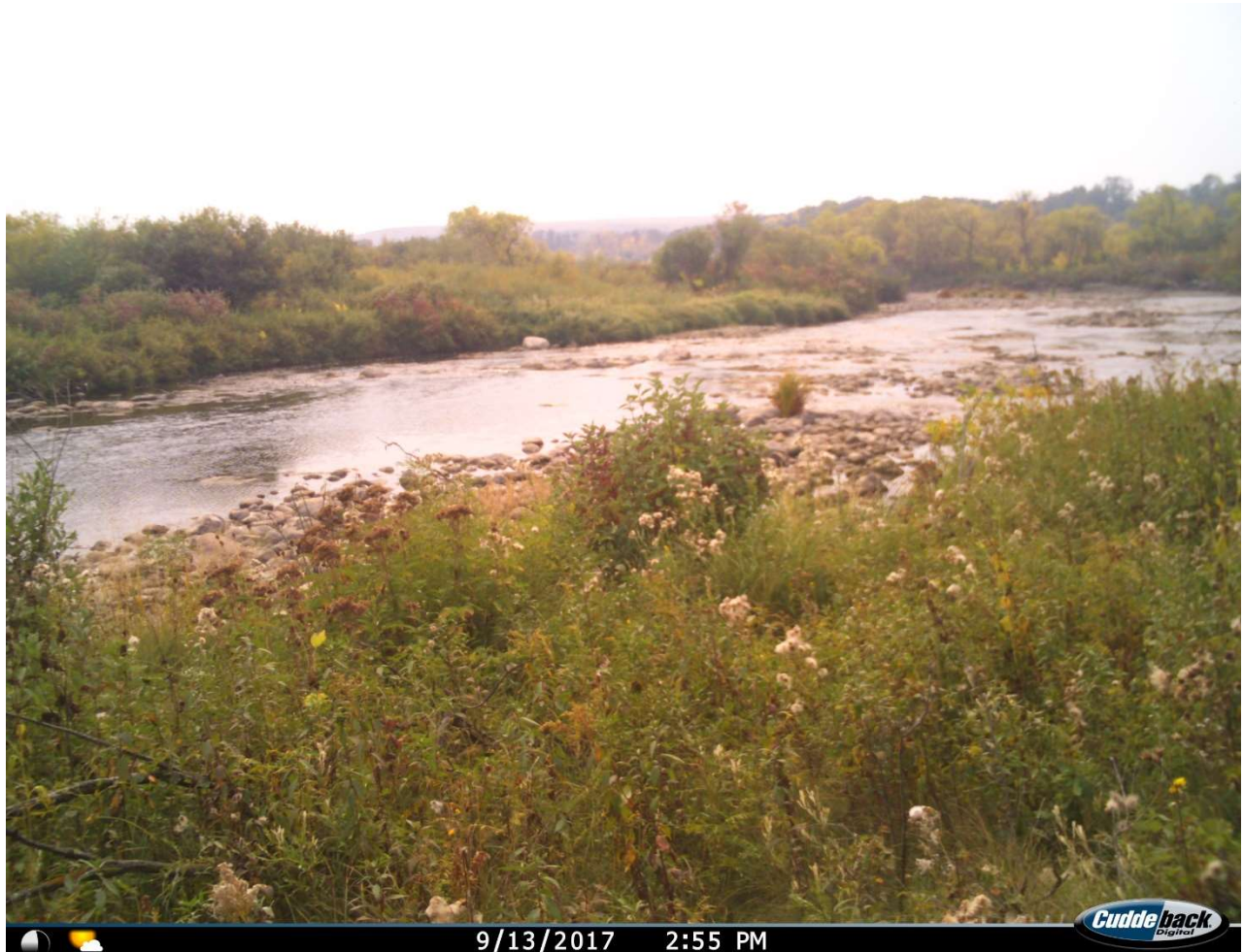
Photo 4: Photo from September 13, 2017 during no pumping withdrawal ( 1.169 \text{ m}^3/\text{s} upstream of diversion, 1.169 \text{ m}^3/\text{s} estimated downstream of diversion) for comparison to Photo 3 with pumping withdrawal

Reference: Daly Irrigation Project – 2018 Monitoring Report