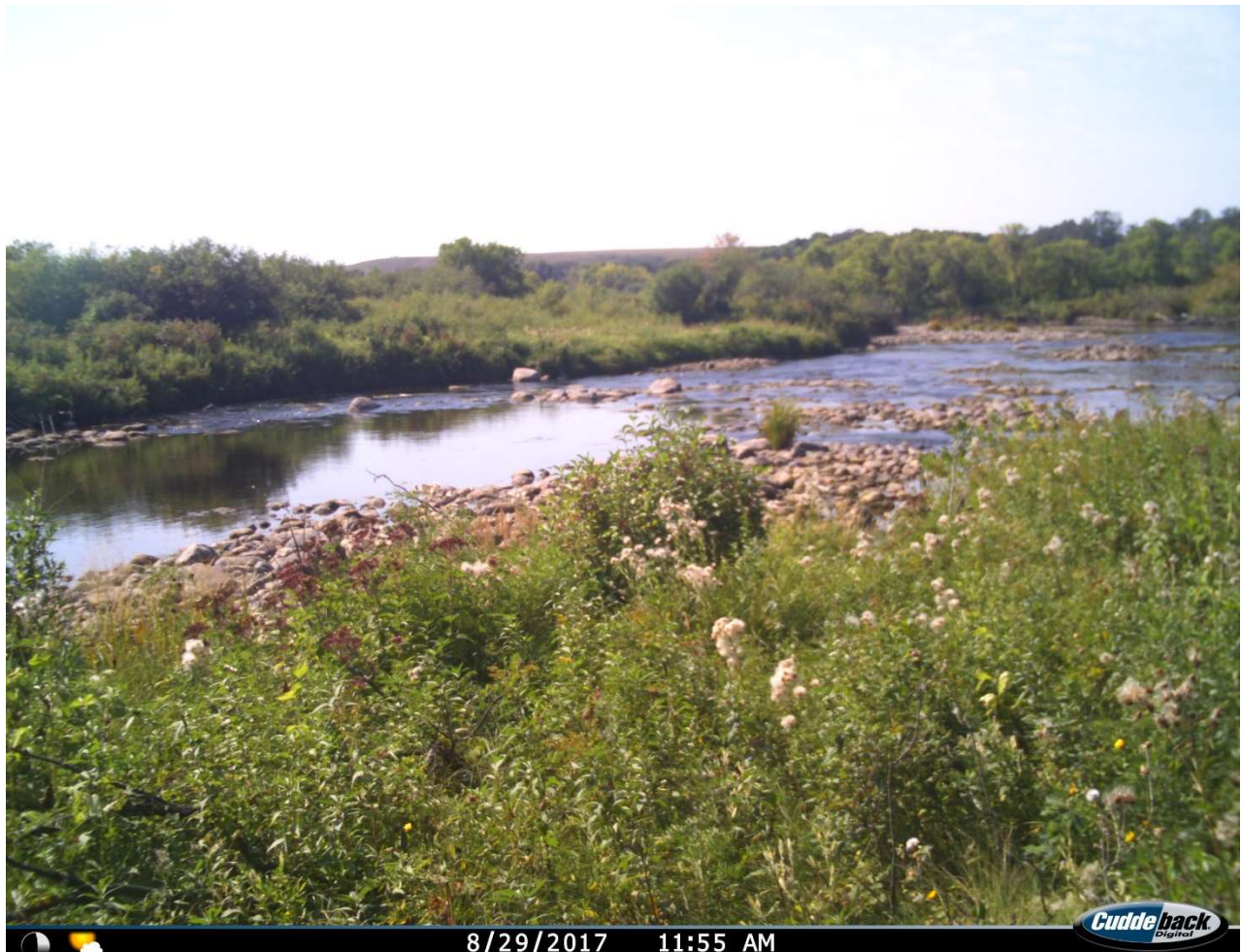
Photo 3: Photo from August 29, 2017 (1.116 m 3 /s upstream of diversion, 0.4625 m 3 /s pumping withdrawal, 0.6537 m 3 /s estimated downstream of diversion) as comparable photo for late season, low water flow with pumping on August 18, 2018 (1.153 m 3 /s upstream of diversion, 0.4825 m 3 /s pumping withdrawal, 0.6700 m 3 /s estimated downstream of diversion)

Reference: Daly Irrigation Project – 2018 Monitoring Report