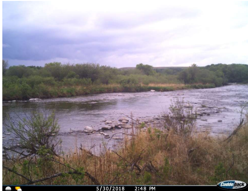
Photo 1: Early season, moderate water flow (5.661 m 3 /s upstream of diversion), no pumping for irrigation (estimated flow rate downstream of diversion 5.661 m 3 /s ) (May 30, 2018)

Reference: Daly Irrigation Project – 2018 Monitoring Report