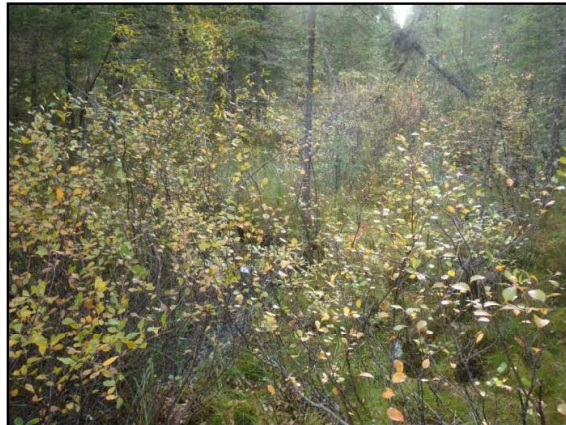
Downstream view of Creek Sixteen 0.2km north of the Conawapa Access Road.