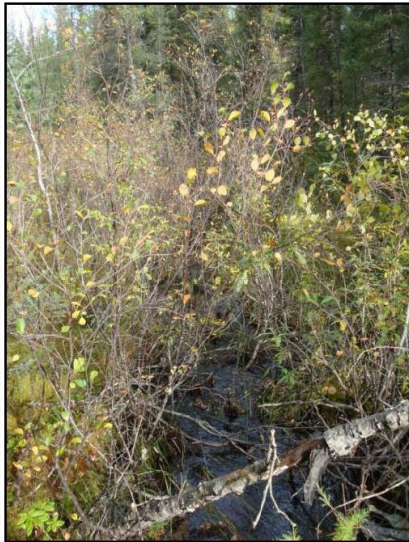
Upstream view of Creek Sixteen 0.2km north of the Conawapa Access Road.