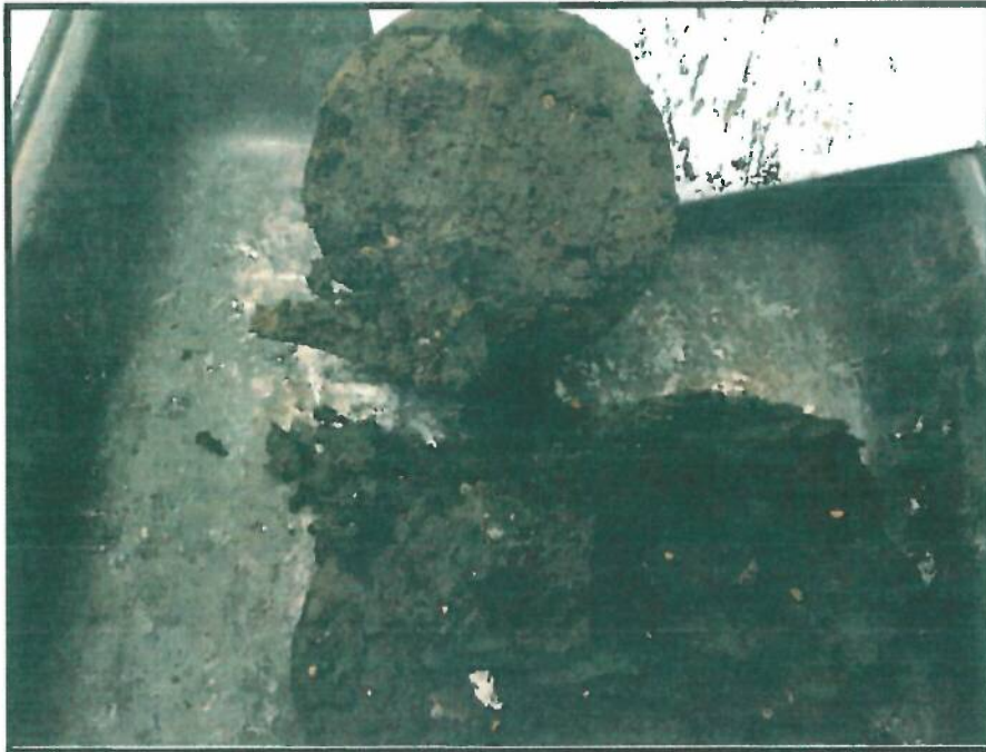
PHOTOGRAPH #2: Sample ST1 after breaking apart.