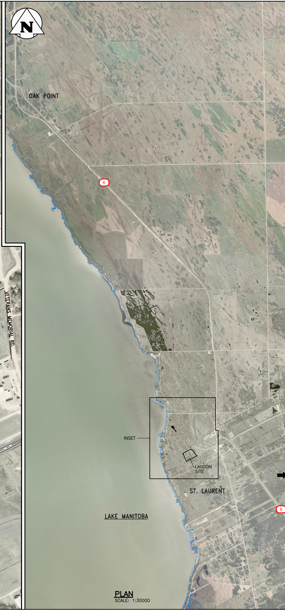
PLAN SCALE: 1:30000