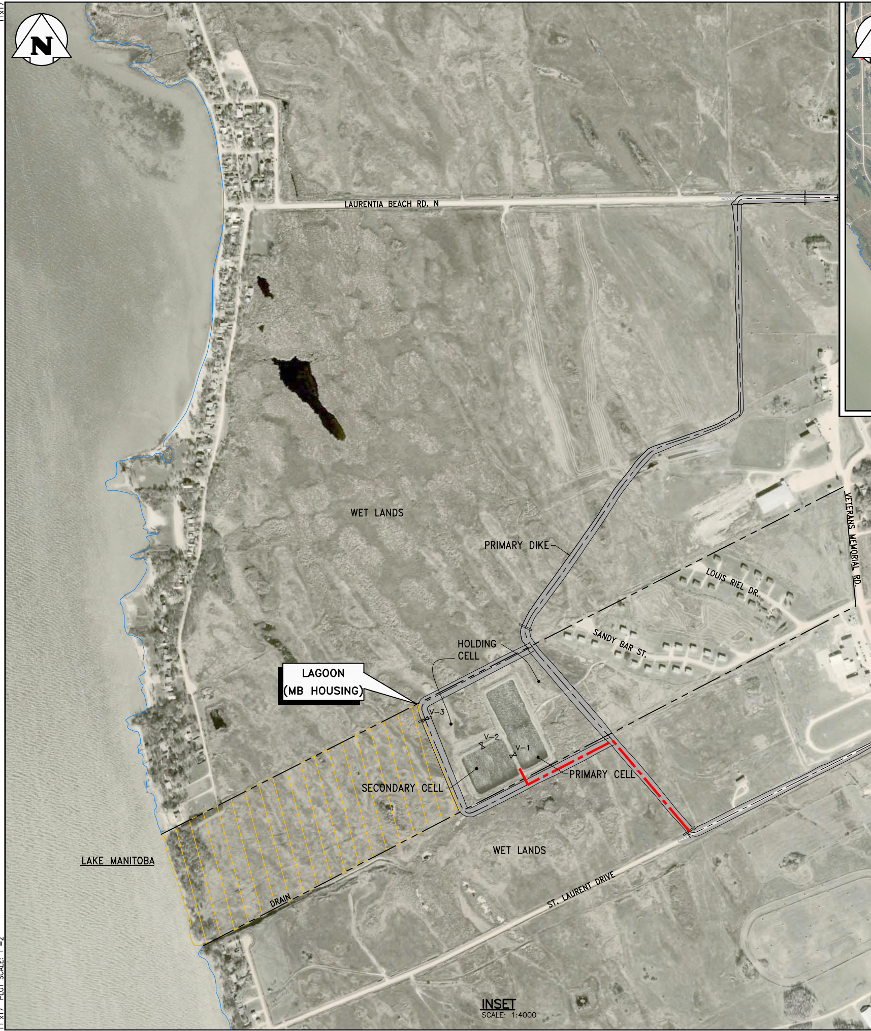
INSET SCALE: 1:4000

File Name: U:\FMS\15-0321-001\15-0321-001_601.dwg - Tab: 001 Plotted By: rmeilleur 16/02/11 [Thu 10:07am] 11x17" PLOT SCALE: 1"=2'