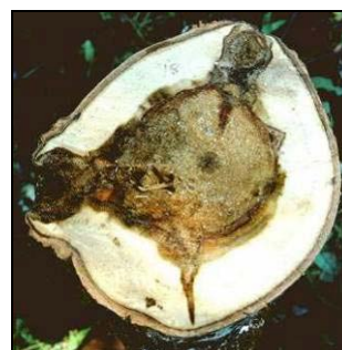
Figure 62: White trunk rot - advanced decay