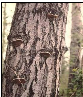
Figure 61: White trunk rot conks

White trunk rot of aspen is caused by the fungus Phellinus tremulae . It is the most important decay-causing fungus of aspen in the Prairie Provinces.