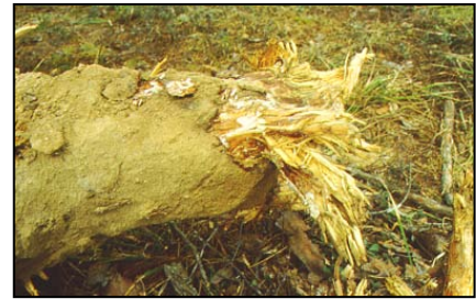
Figure 53: Yellow stringy butt rot

Yellow stringy (white stringy) butt rot: This decay is present in all conifers, but occurs in relatively small amounts in pines. It is primarily a butt rot. Affected wood becomes yellow or yellow-brown with the formation of pockets in the springwood. The pockets frequently coalesce causing separation of the annual rings. As the decay progresses, the wood is reduced to a loose, stringy mass of orange-yellow fibres (Figure 53). In the more advanced stages, empty cavities exist in the centre of the bole.