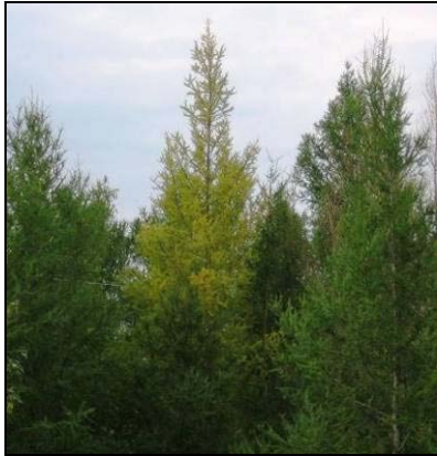
Figure 13: Larch declining due to eastern larch beetle

The eastern larch beetle, Dendroctonus simplex occurs throughout the range of tamarack, which includes northeastern United States, much of Canada and into Alaska. In Manitoba, localized outbreaks have occurred in the past. However, an outbreak which commenced in 2001 has expanded throughout much of tamarack's range within southeastern Manitoba and the boreal plain forest. Three successive winters with above normal temperatures, resulting in increased larval and pupal survival, combined with excessive precipitation increasing tree stress, are contributing factors to this widespread outbreak.