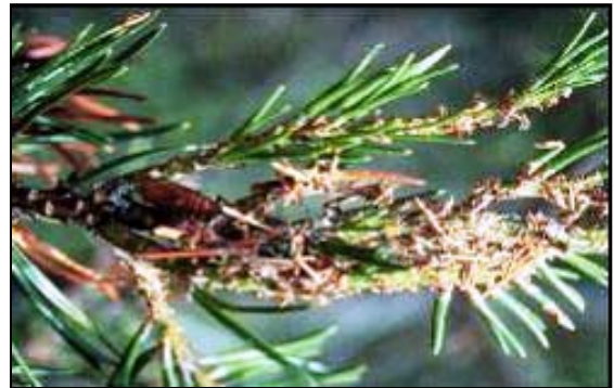
Figure 4: Severe jack pine budworm defoliation – scorched appearance