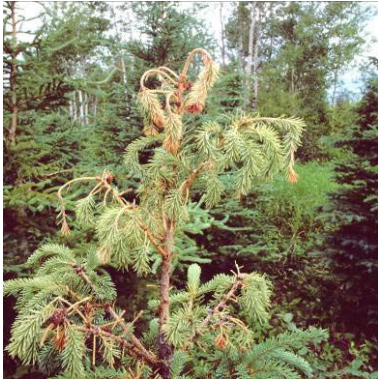
Figure 7: White pine weevil exit shepherd's crook

regenerating white pine. It is also an important pest of young spruce plantations in western Canada. It predominantly attacks trees between the ages of five to 35 years.