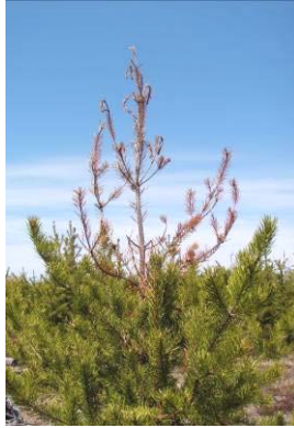
Figure 8: Late season white pine weevil symptom