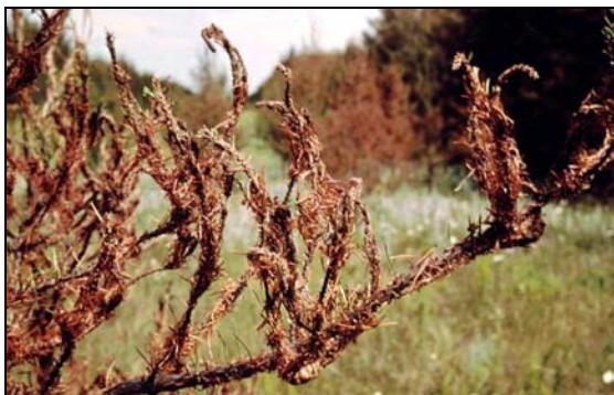
Figure 3: Partially consumed needles clipped and webbed to shoot with frass and a pupal case

Jack pine budworm, Choristoneura pinus pinus (Freeman) is a major pest of pines in the Great Lake States of Michigan, Wisconsin and Minnesota, central and northwestern Ontario, Manitoba, and Saskatchewan. Severe outbreaks seriously affect the growth and quality of vast areas of pine. Jack pine is the favoured host, but red pine, Scots pine, lodgepole and occasionally white pine can be seriously defoliated when growing near susceptible jack pine.