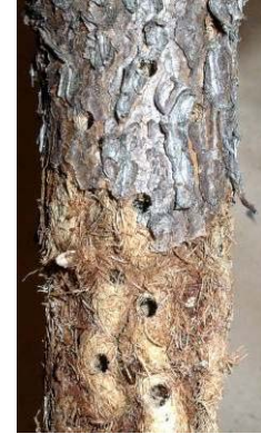
Figure 9: Adult weevil holes with chip cocoons