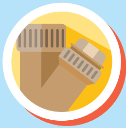
Tap water in homes built before 1990 may contain lead