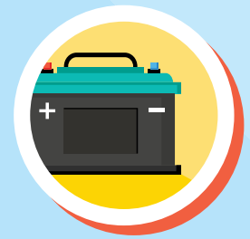
Some consumer products contain lead