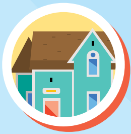
Paint on older homes may contain lead

It is now known that even small amounts of lead exposure can cause health effects, particularly for fetuses or young children. That's why it is important to know how lead exposures happen and what you can do to reduce exposure for yourself, your family, and children in your care.