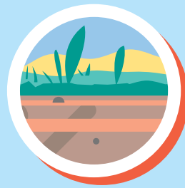
Soil may contain lead