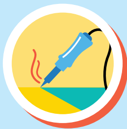
Some hobbies and jobs can expose you to lead