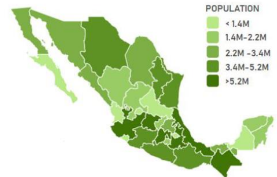
FIGURE 1. NUMBER OF INHABITANS PER STATE (2018)