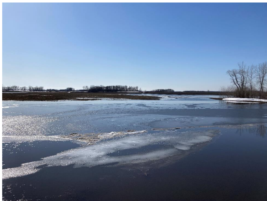
Figure 1. Early spring flooding on Manitoba farmland

Spring flooding may cause large losses of fall-applied nitrogen (N) fertilizer and residual nitrogen left over after the previous crop or fallow year (Figure 1). The following topics deal with losses of residual soil N, fall-applied N fertilizer, other nutrients, and how to determine the extent of N loss.