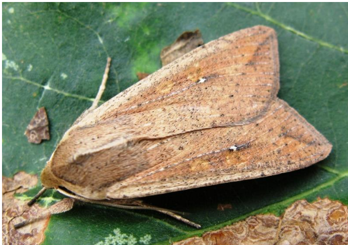
Figure 4. Armyworm moth.

Armyworm moths have pale brown forewings, each with a single small white spot. Make sure to count only armyworm moths, as other moths may also end up in the trap.