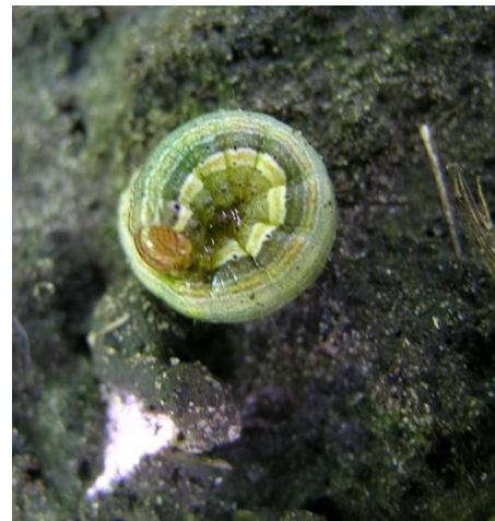
Figure 5. Armyworm larva