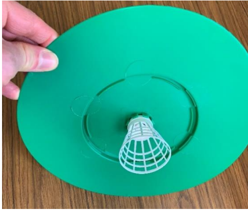
Figure 2. Shuttlecock attached to lid.