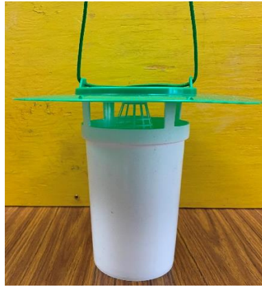
Figure 3. Multipher trap assembled.